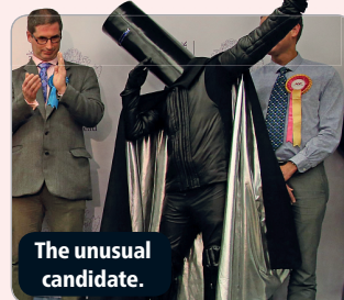
The unusual candidate.

Lord Buckethead has competed in the same constituency (area) as the Prime Minister (PM) of the time in three previous general elections. This year, Buckethead will stand against PM Boris Johnson, but will do so under the new name of Count Binface. Buckethead is a character from a film and the director has now said the name cannot be used.