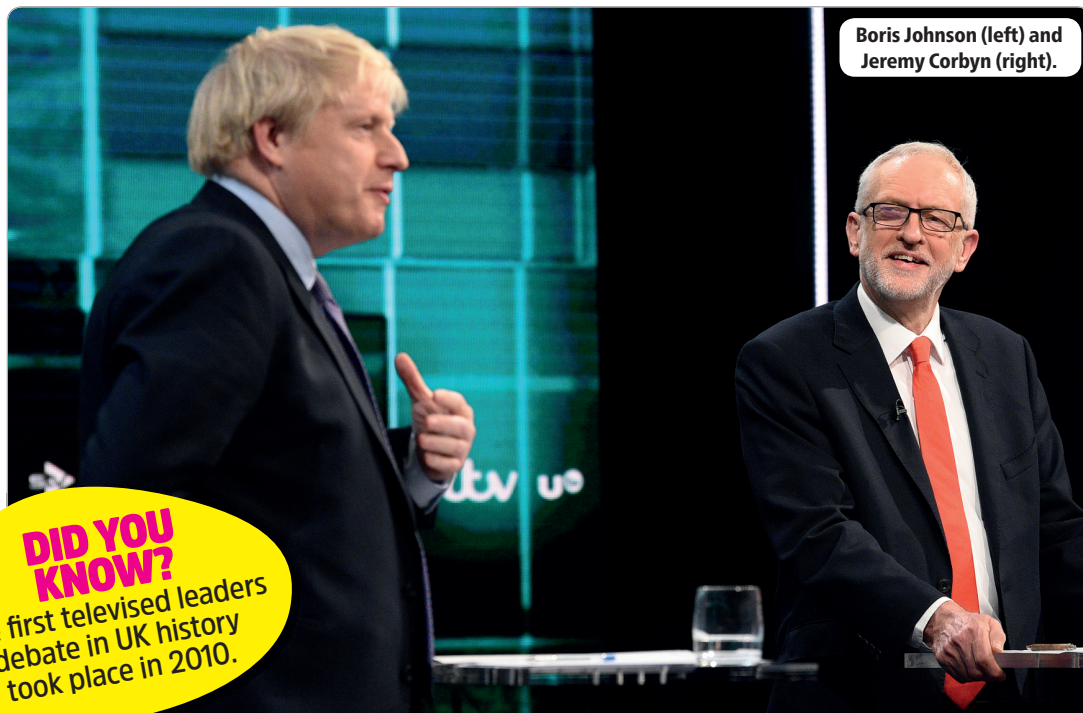
Boris Johnson (left) and Jeremy Corbyn (right).